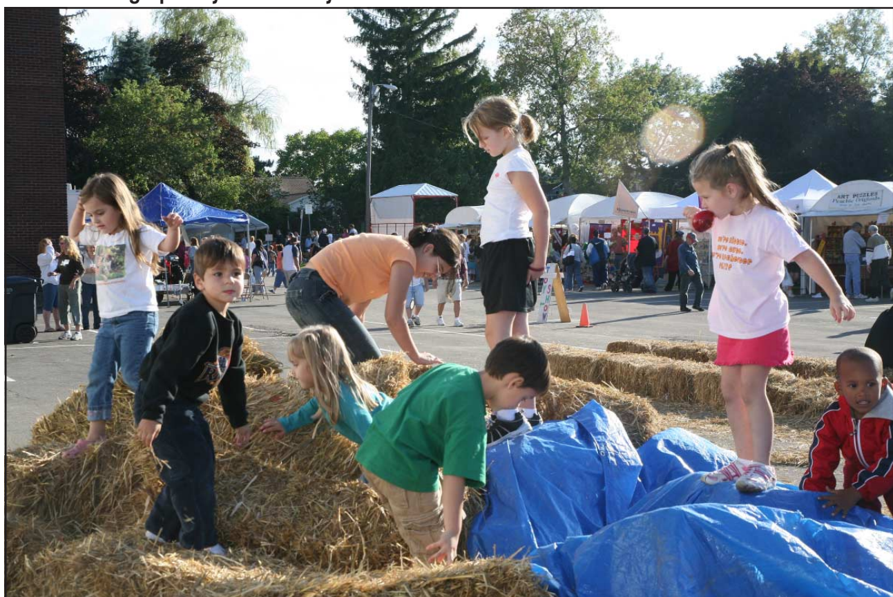
It was "King of the Mountain" time when children found a mound of hay bales to play on. Fortunately this year there was no need for using the hay bales to dry out the grounds as the entire weekend was rain-free and pleasantly warm and sunny.