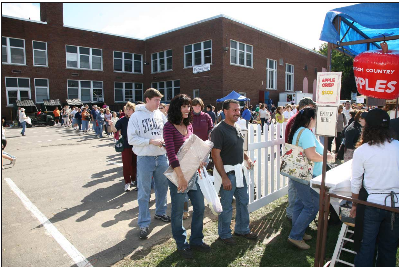
Those in the long line for Apple Crisp waited for a sample of the five foot diameter pan of the fall favorite. It was sold out in less than two hours on Saturday of the festival.