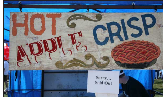
It's the same old story; if you come to the Apple Crisp stand after 2 p.m. you will find the delicacy sold out!